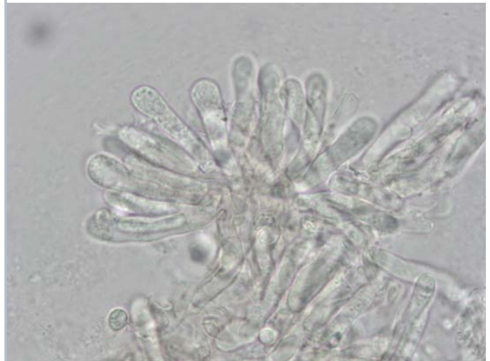
Flammer, T© Schaffhausen