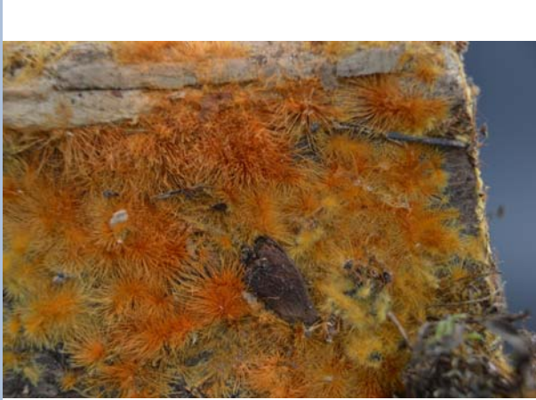
Ozonium auf Fagus

Fungi, Dikarya, Basidiomycota, Agaricomycotina, Agaricomycetes, Agaricomycetidae, Agaricales, Psathyrellaceae