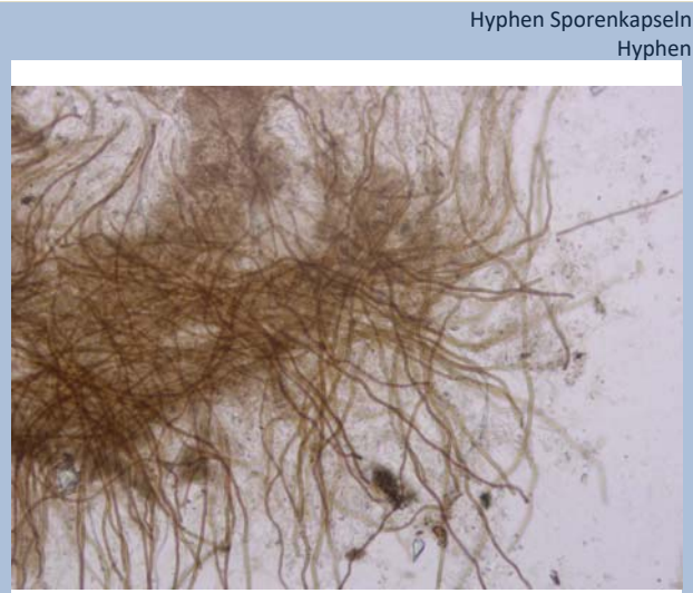
Hyphen Sporenkapseln Hyphen