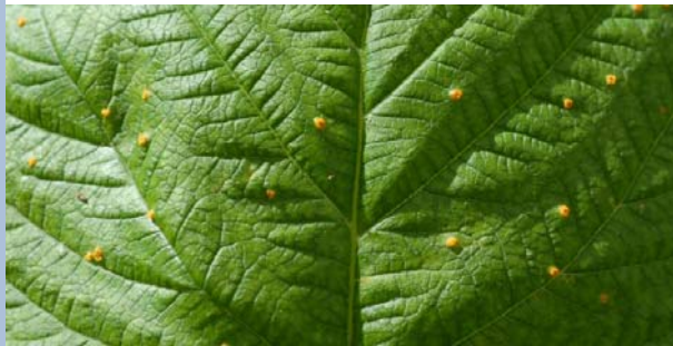
Blatt mit Rostherden