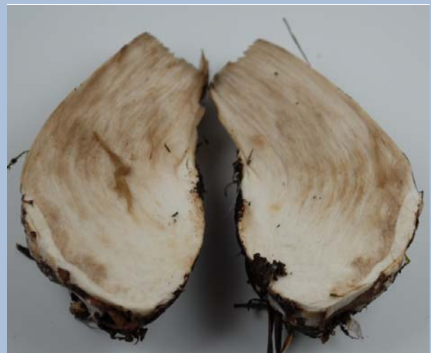
Knollige Stielbasis mit Volva (wie Eierschale)